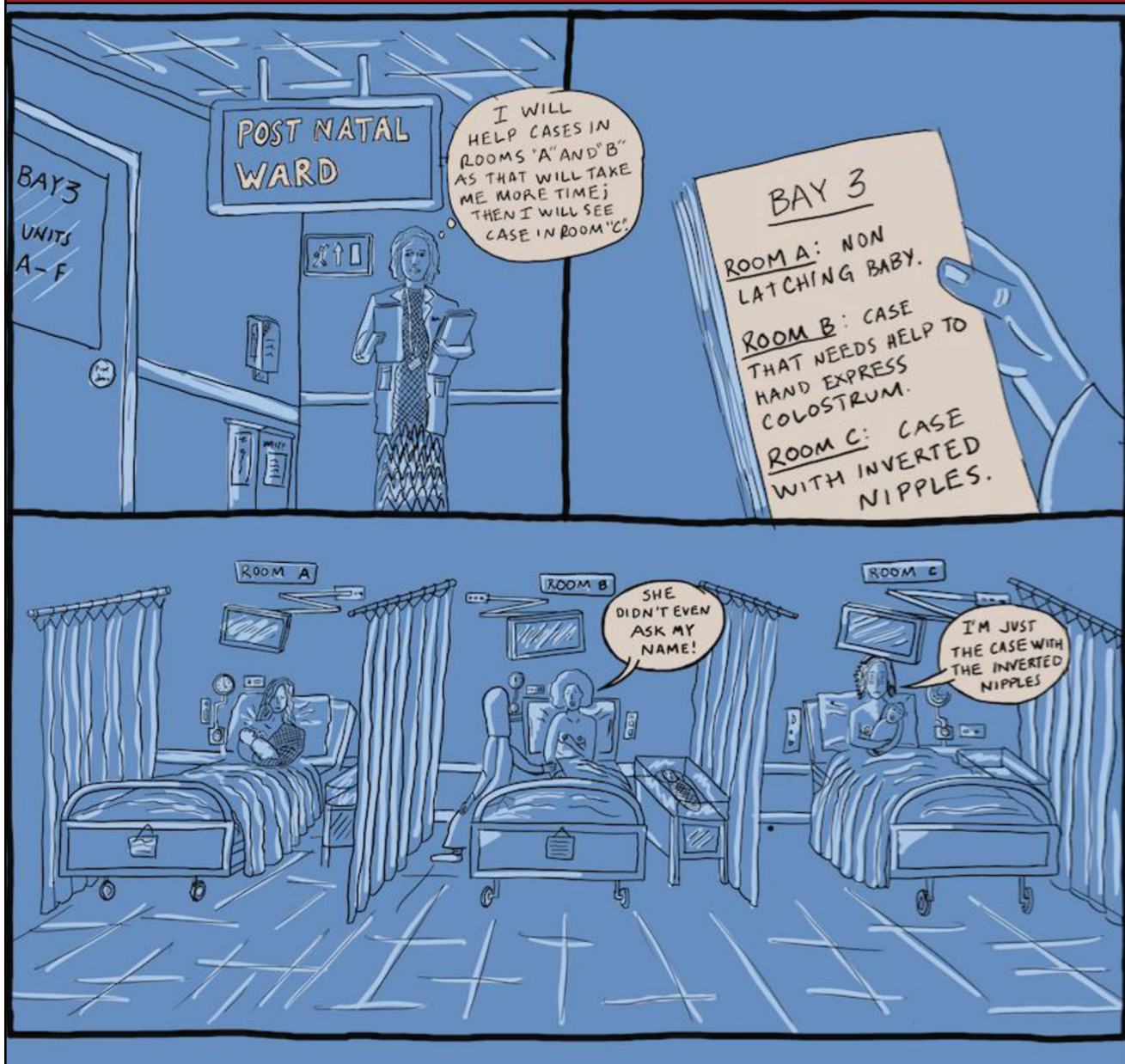
Figure 2. Lack of human connection.

© Francisco de la Mora. Reprinted with permission.